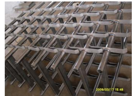
welding steel shelf