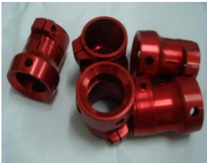
red anodizing bushing