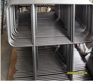
folding Steel Tube