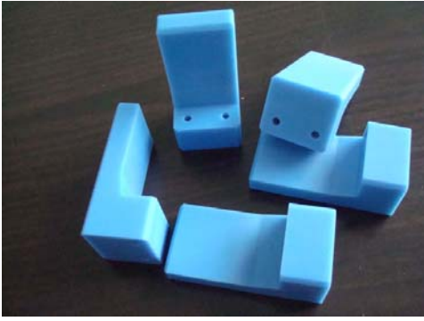
Blue MC (Nylon)