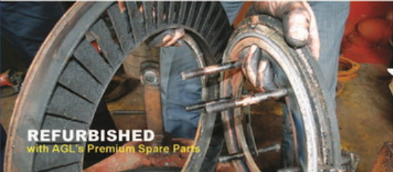
REFURBISHED with AGL's Premium Spare Parts