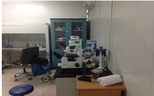
Recombinant Antigen RD Lab