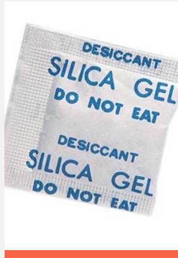
Silica Gel Desiccants